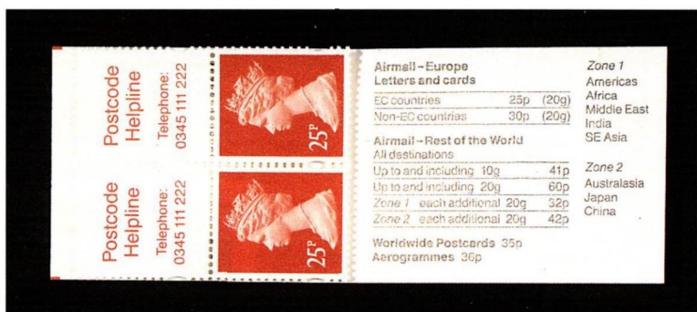
50p book ( Giant's Causeway - Sep 1995 ) showing 25p vertically se-tenant with Postcode Helpline labels

I have mentioned the 1840 anniversary issue and this is a very interesting closed group, having a direct connection with the beginning of stamp collecting. One of the unissued plates of the original Victoria head was combined with the Machin head to make the design (hence the popular reference to these stamps as "double heads"). This was very skilfully done by Jeffery Matthews. This group would make a splendid adjunct to a classic collection of penny blacks and twopenny blues, especially as the colours of the stamps were black and light blue in a conscious decision to link them with their famous predecessors. There were only five values and all were printed in sheets by photogravure. The stamps were not issued in coils, but the two lower values, 15p and 20p,