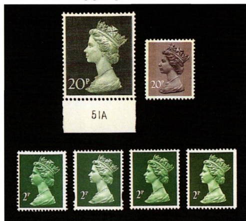
Six printers – 20p Bradbury Wilkinson (Recess, 1970) and Waddington (Litho, 1980); 2p Photogravure (Harrison 1988 and Enschedé 1995) and Litho (Questa 1988 and Walsall 1993)

A traditional interest of all stamp collectors is perforation and the Machin series offers ample opportunity to build a collection around the subject. While only four gauges have been used, one of them an error but knowingly released (on some Walsall booklets in October 1990), a study of the various perforators used, both rotary and comb-operated, interests many people. Then there are the elliptical perforations, introduced to small format definitives in April 1993; these make a collecting group on their own.