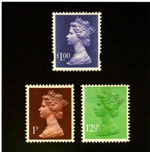
Top: The new £1 – Mr Myall's favourite Machin! Below: 1p and 12½p values – ideal for specialist study

All restricted forms of Machin collecting fall into one or other of two groups. I call these "closed" and "open". By a closed group I mean one in which there will be no more issues. For example, the series issued to commemorate the 150th anniversary of the penny black is a closed group. An open group is one which is concerned, at least partly, with issues which are still on sale. Examples are stamps with blue fluor in the phosphor ink, or machine vended booklets. Each kind of group has its advantages and disadvantages. The collector of a closed group knows that he is not going to be under the pressure of having to keep up with anything and everything that Royal Mail issues within his area of interest. On the other hand, he will be unable to obtain his wants at face value at his local post office and may find some of his purchases cost a considerable sum. Of course, even items in an open group may also cost a lot if they consist of errors, but there is always the chance of a lucky find, such as imperforate stamps or ones with