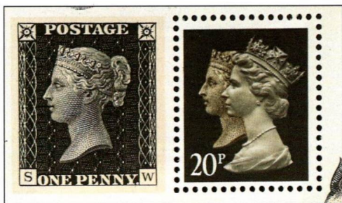
20p Machin (photo) with "Penny Black" (recess) from 1990 miniature sheet

More specialized have been the variations in the pin layouts on the margins of booklet panes brought about by operational requirements (The Great Britain Decimal Stamp Booklet Study